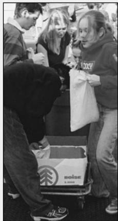
Students from Head Royce School in Oakland helped lift nearly one million pennies into the Pennies Truck. Together, their school raised over $9,200 for AEF clients! See related story on page 3.